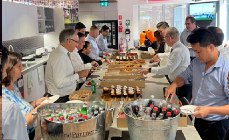
Morning tea under way in Sydney