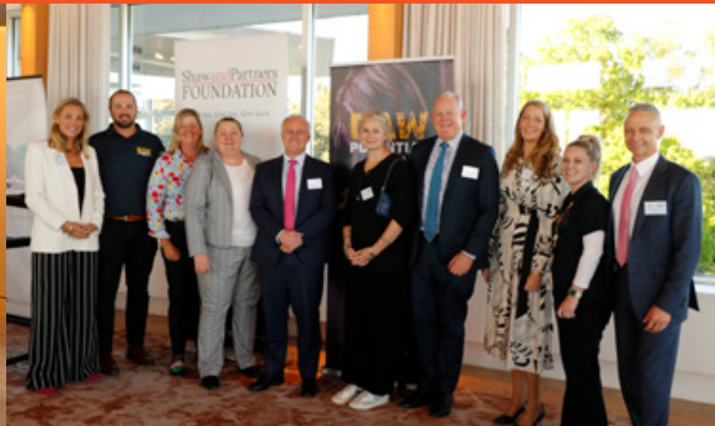
Fundraising evening in support of Raw Potential Youth