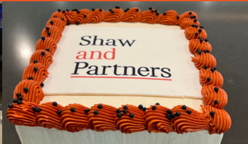
Let the celebration begin!