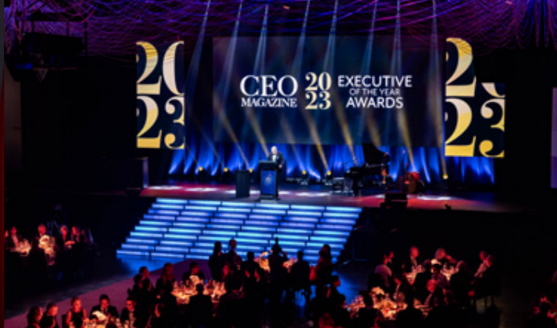
Shaw and Partners was a major sponsor of The CEO Magazine Awards