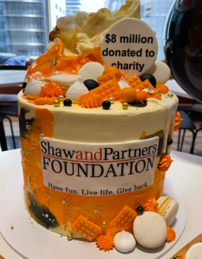
A big cake for a big celebration!