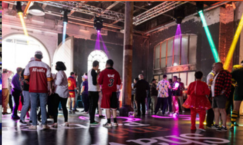
90s/00s Warehouse Party for the Shaw and Partners Sydney Office