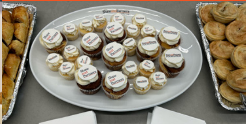
Cup cakes for everyone in the Canberra office