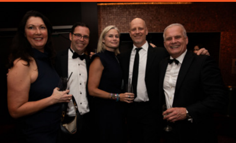
Shaw and Partners advisers and Foundation Committee members